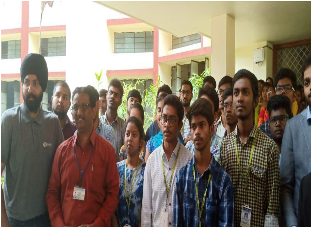
Start-up Yatra Van at KITSW (19.09.2018)