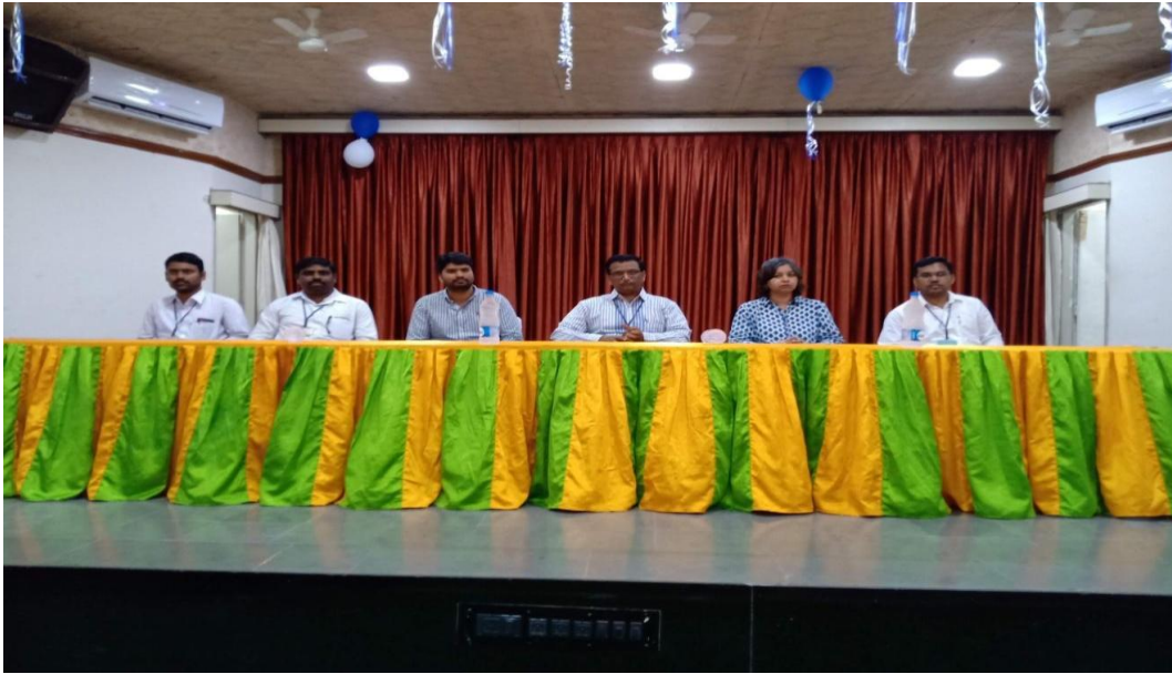
Inaugural function of ISB-TEP orientation programme (04.09.2018)