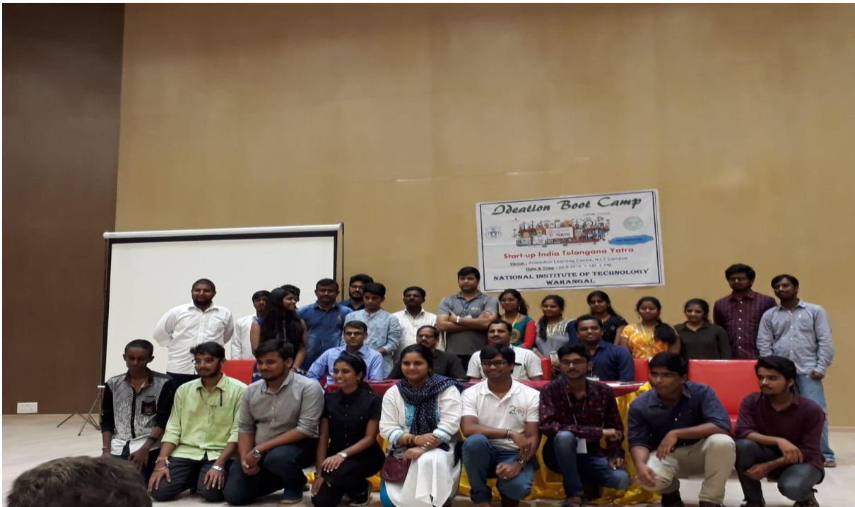
Start-up Yatra Shortlisted teams at NIT Warangal Boot Camp (22.09.2018)