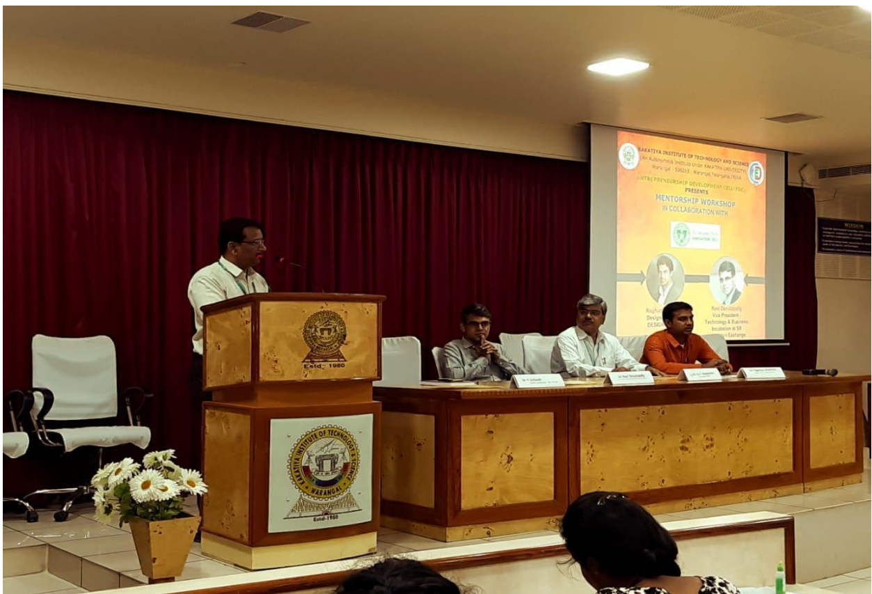
Inaugural session of Mentorship Workshop (31.01.2019)