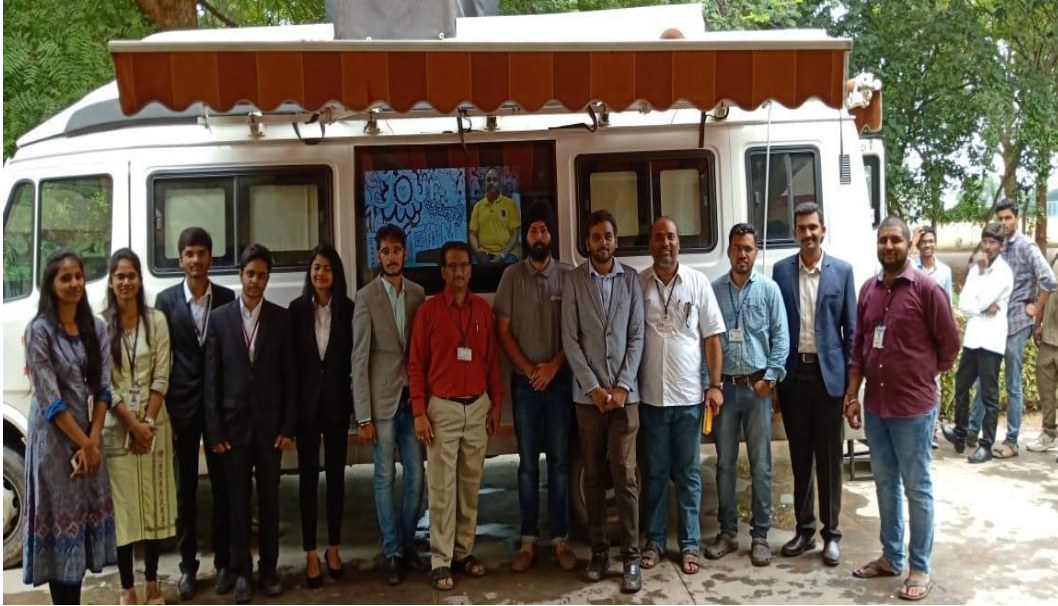
Start-up Yatra Shortlisted teams at NIT Warangal Boot Camp (22.09.2018)