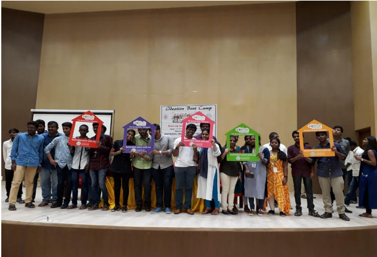
Start-up Yatra Shortlisted teams at NIT Warangal Boot Camp (22.09.2018)